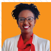
Identifying your purpose by Pheona Nabasa Wall

Identifying your purpose is a crucial step in personal and professional development. It involves reflecting on your values, passions, and the impact you want to have on the world. By clarifying your purpose, you can align your goals, decisions, and actions with what truly matters to you.